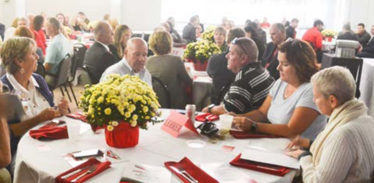
More Lehrers trooped out to cheer on Mac.