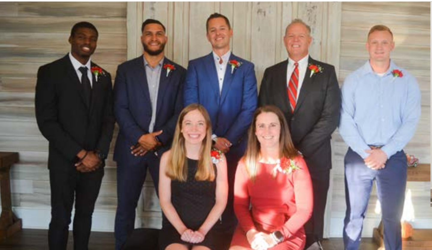
Most of the inductees present at the end of the ceremony