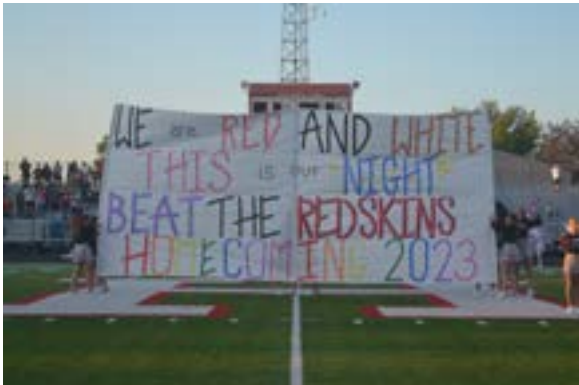
Traditional start - cheerleaders work on sign all week so boys can burst upon the field.