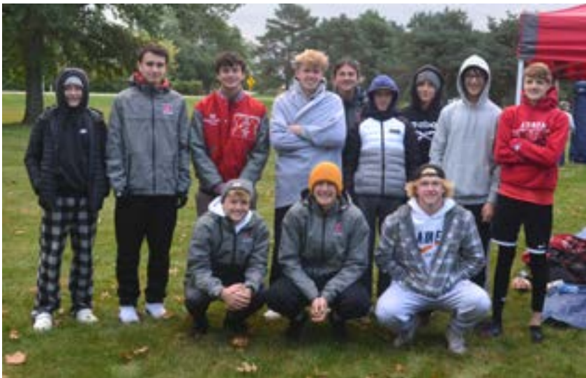
Tiger boys' Cross Country team readies for the 5k at the Huron Invitational